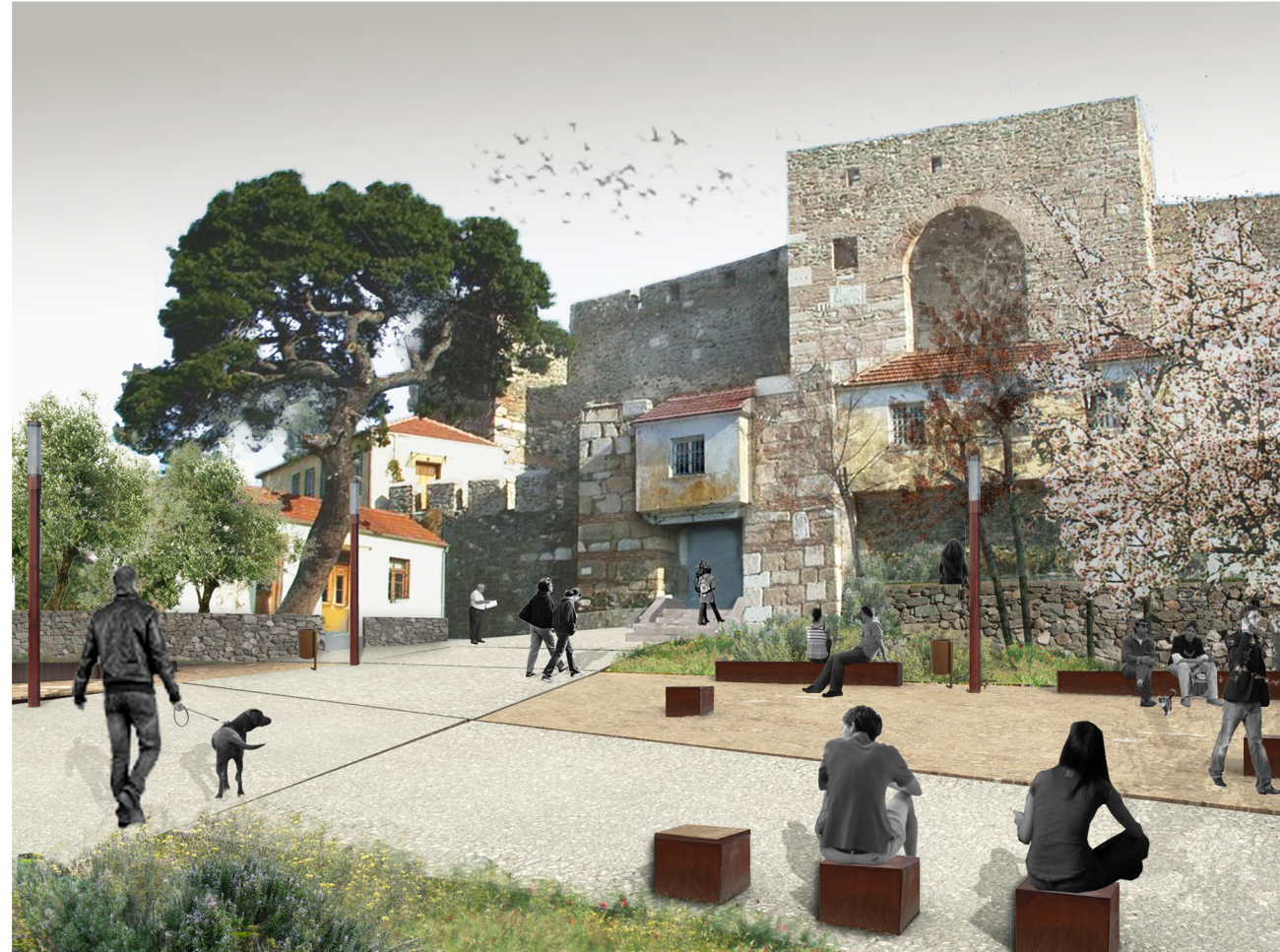
View 3 : Main entrance plaza