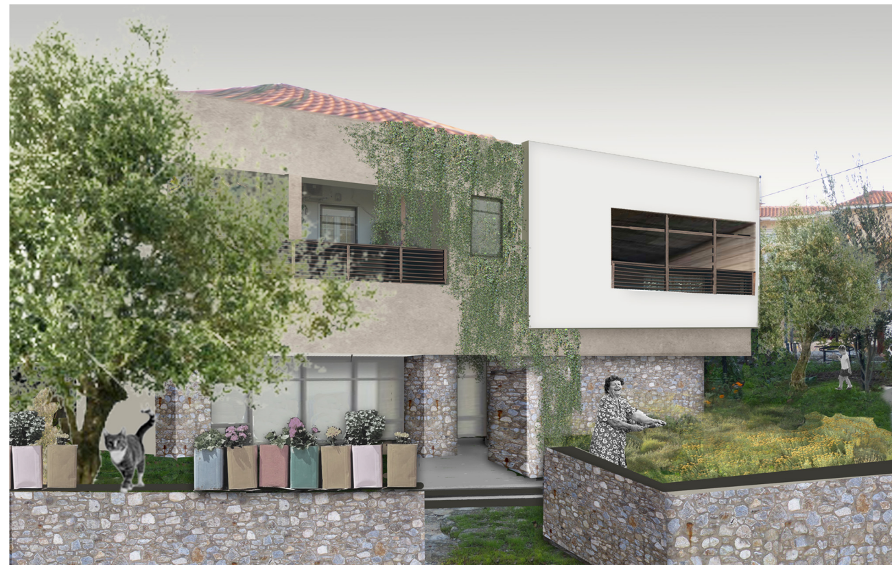
View 5 : reformation of the existing houses